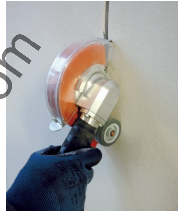
For cable slots in concrete, brick etc.